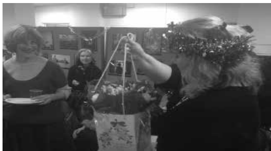
LFB's Xmas party