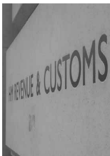
HMRC’s old-school analogue head office in Whitehall.