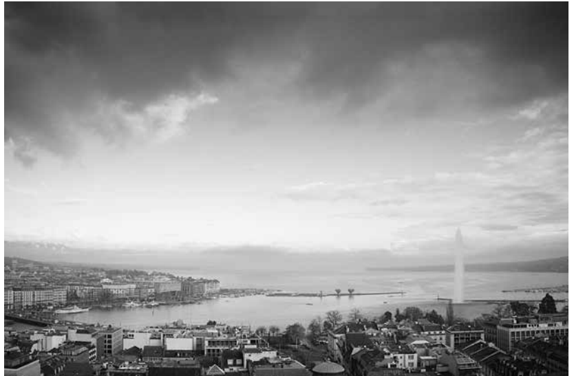
Geneva, home of the International Labour Organization (above) and of WIPO (below)

Members can find full text of all motions for Delegate Meeting on the NUJ's website near www.nuj.org.uk/about/union-democracy/