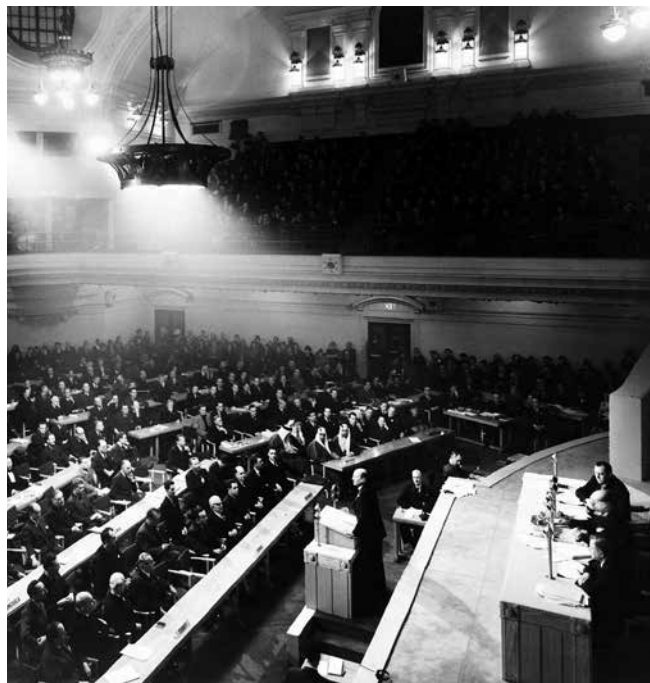
1946: opening session of the UN General Assembly